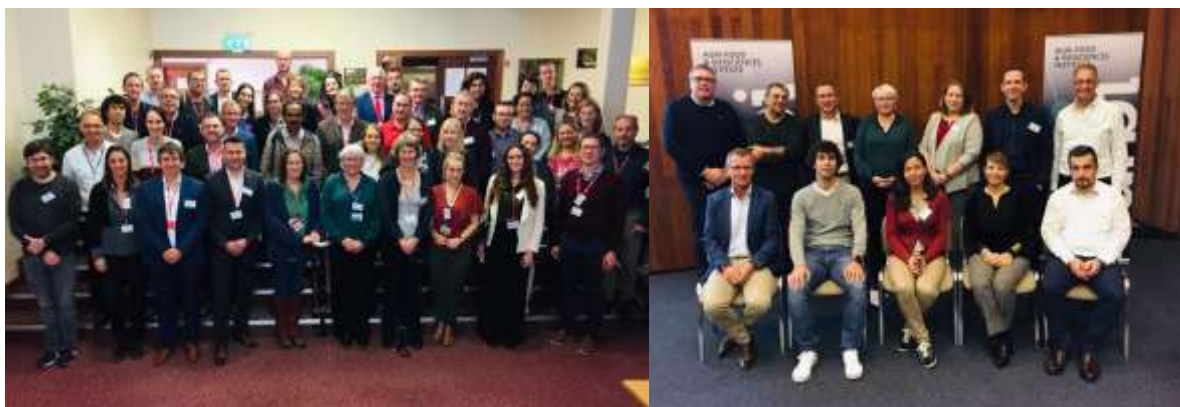
Photos from the InnoVar kick-off meeting. On the left - KOM attendees, on the right – Project coordinator and speakers from Day 1.

InnoVar aims to augment and improve the efficacy and accuracy of European crop variety testing and decision-making, using an integrated approach incorporating genomics, phenomics and machine learning. Historic data will form the foundation of the InnoVar database which will be expanded with new harmonised data generated from a trial series across Europe. The project focuses on wheat initially before applying the InnoVar approach to other crops.